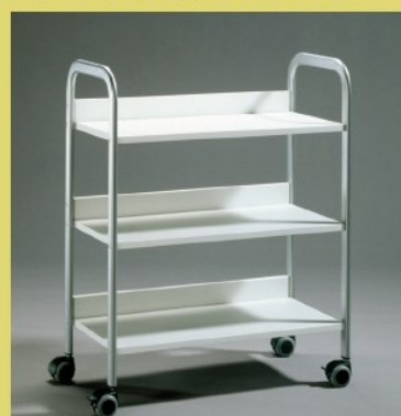
Multipurpose trolley 1