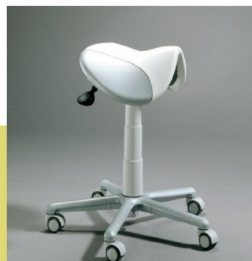
Examination chair with saddle seat