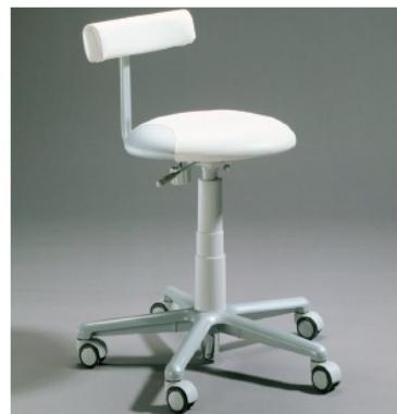
Examination chair with back rest