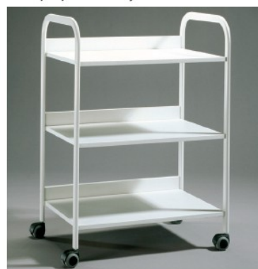
Multipurpose trolley 2