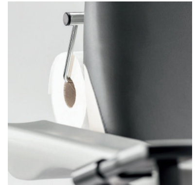
Paper roll holder